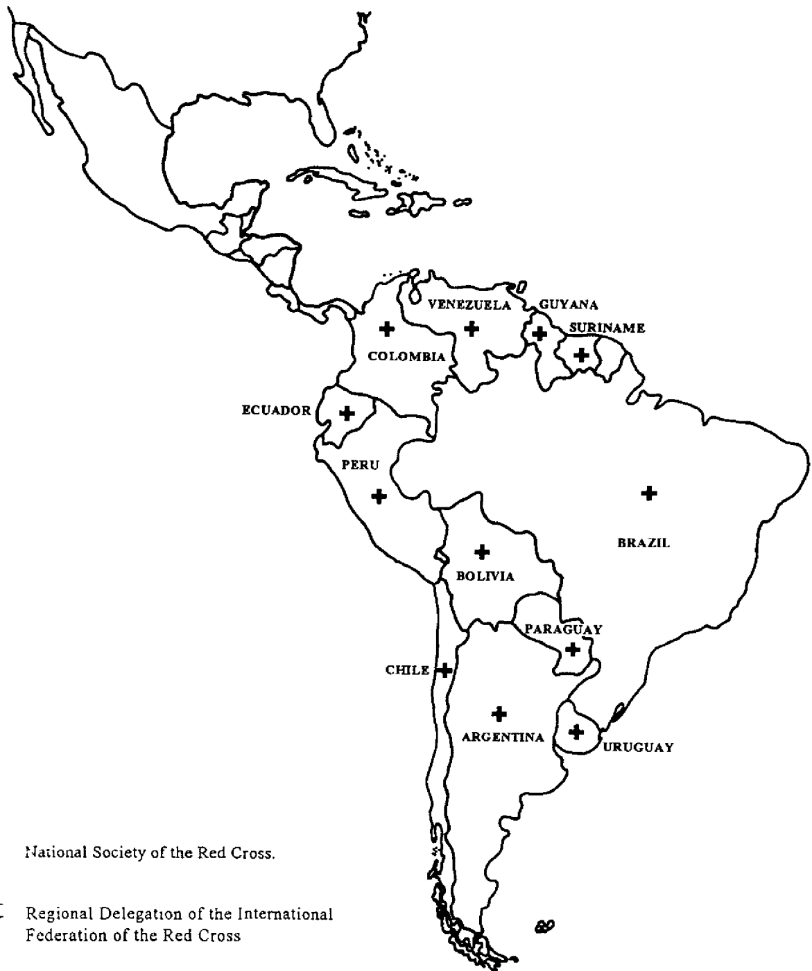
Map 3 SOUTH AMERICA