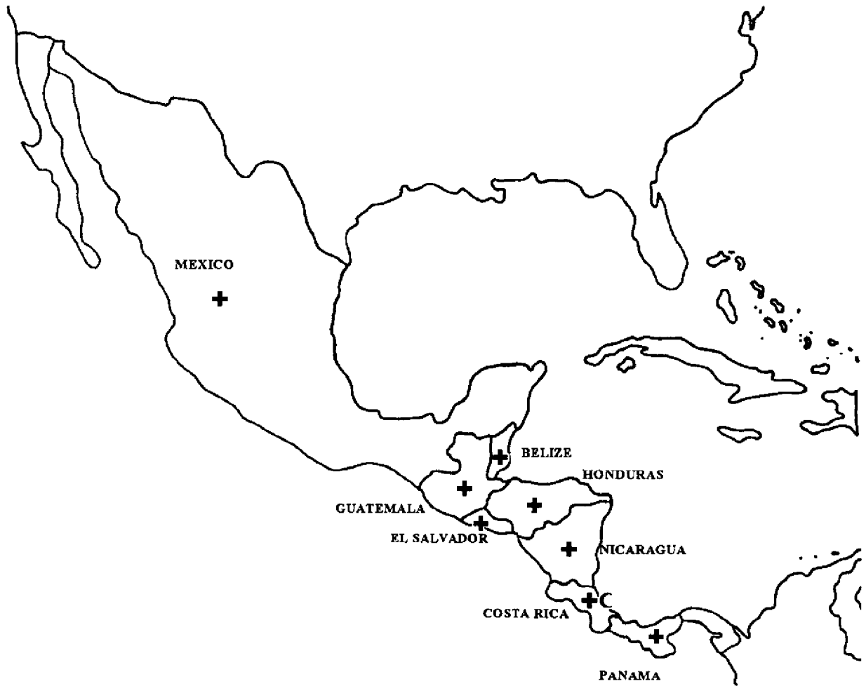
Map 1 CENTRAL AMERICA AND MEXICO