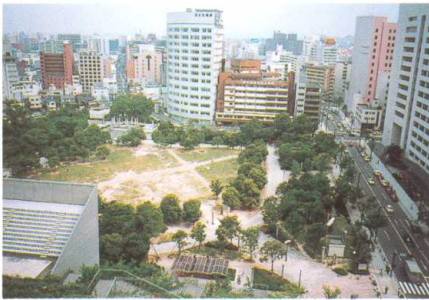
防災公園の整備（福岡県） Developing a disaster prevention park (Fukuoka Prefecture).

既に、平成8年度を初年度とする五箇年計画が全47都道府県において作成され、それに基づく事業の推進が図られています。計画に計上された事業で国の補助等が行われる事業については優先的に助成されるとともに、一部事業については通常の補助率をかさ上げする等の措置が講じられています。