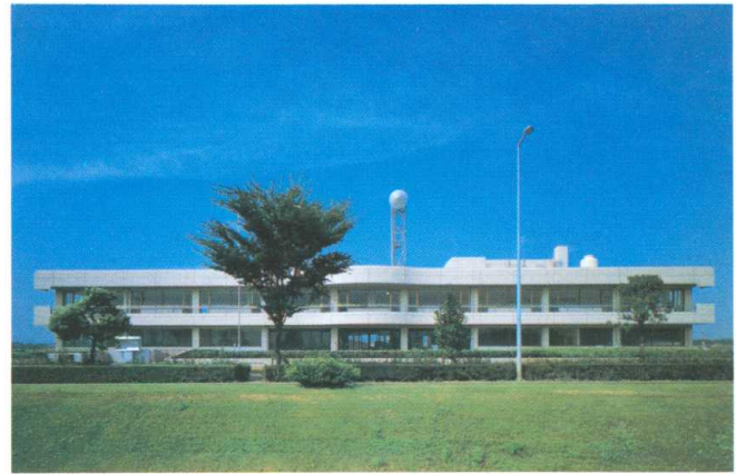
立川広域防災基地 災害対策本部予備施設 Preparatory Institution for Headquarters for Disaster Countermeasures of Tachikawa Regional Disaster Prevention Base

These activities include subsidizing the development costs incurred by the prefectural governments for those bases that are designed to provide emergency services when disasters occur and that function as centers for providing public relations information, education and training on disaster prevention during normal times.