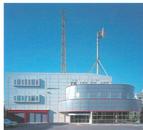
東京都目黒区防災センター Disaster Prevention Center in Tokyo's Meguro Ward