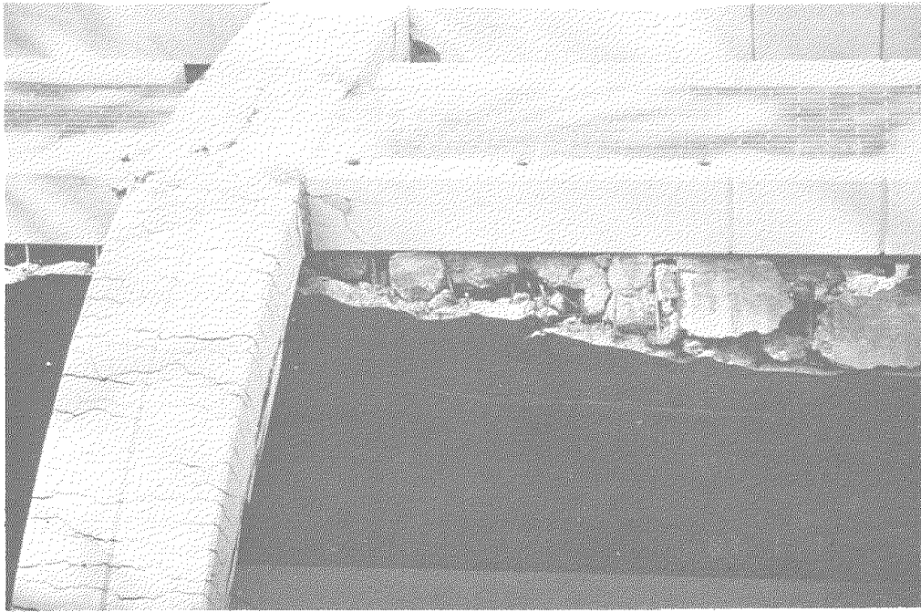
Fig. 51 CSUN parking building. Note RC column ductility