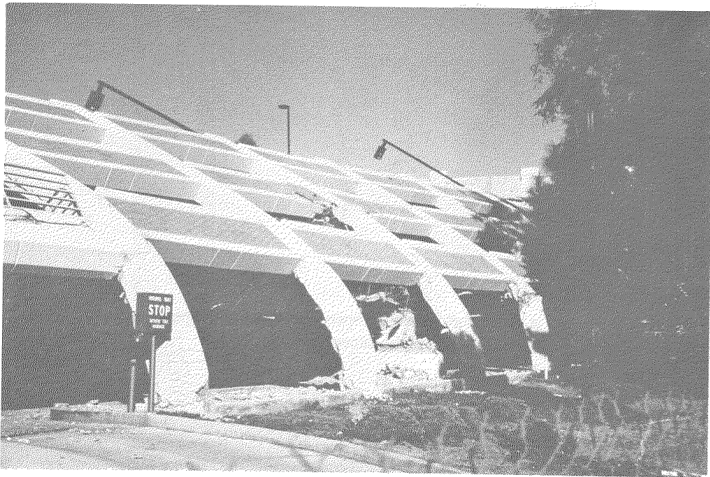
Fig. 50 CSUN parking structure collapse.