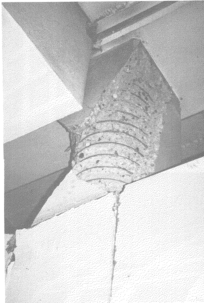
Fig. 48 Short column property confined with spiral reinforcement.