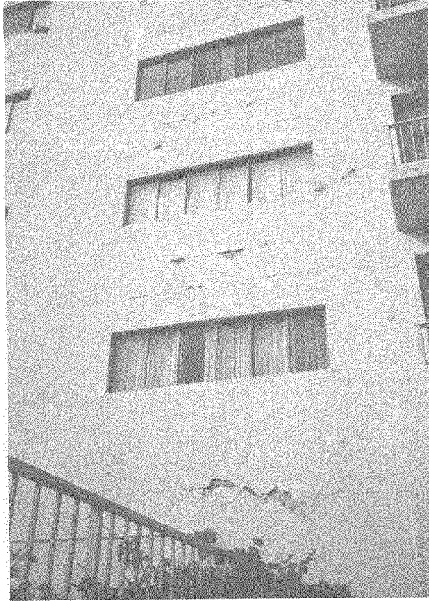
Fig. 45 Damage along construction joints, probably due to bond distress.