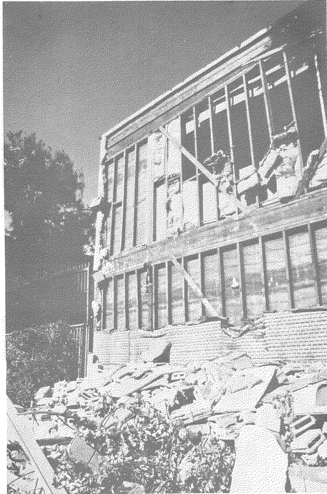
Fig. 38 Typical wood frames. The structure did not have structural walls.