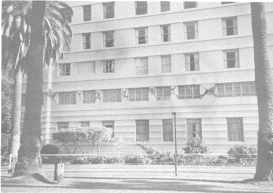
Fig. 33 Shear cracking in columns and wall piers at the second floor in St. John's Hospital.